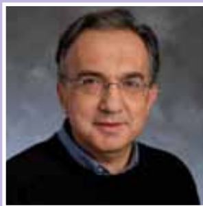
Sergio Marchionne Chairman and CEO Chrysler Group LLP